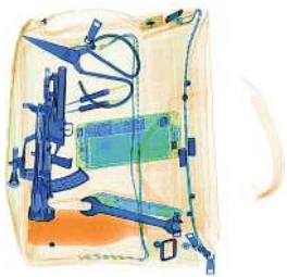
High resolution scan image