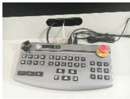
Friendly operation keyboard (Touch screen is optional)