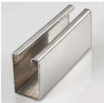
Name: guide rail Material: SUS 201# Spec: 100mm Width Color: nateiral T: 1.15mm