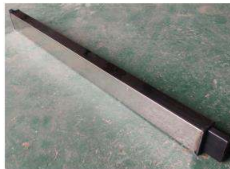
Name: bottom rail Material: SUS201# Spec.: 75*45 squire tube color: nature color T: 0.75mm