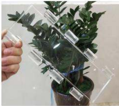
Name: crystal slat Material: PC Spec.: 265*110 Color: transparent T: MT1.4mm/ST 3.0mm