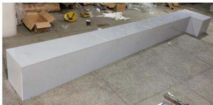
Name: cover box Material: SUS201# Total lenght=8100mm The zinc square pipe is used as the support frame, and the cover plate is buckled on the galvanized pipe. It is a split type. When the customer is installed on site, it needs to be assembled in two butt joints.