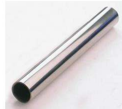
Name: joint pipe material: SUS 201# Spec.: \Phi 12.5\text{mm} T: 0.55mm