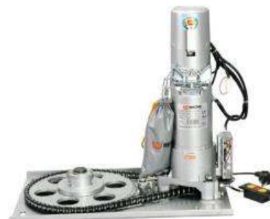
Name: china motor brand: JL Material: copper core Spec.: 800kg/220V 50Hz with 2pcs remote control