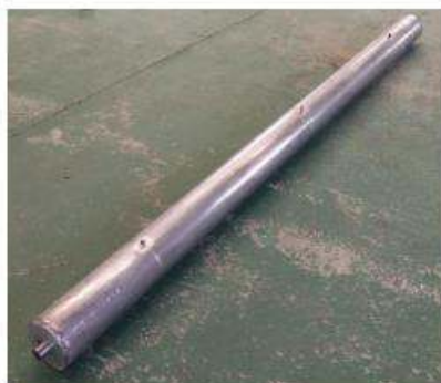
Name: rolling pipe Material: GL steel Spec.: 6inches T: 1.8mm