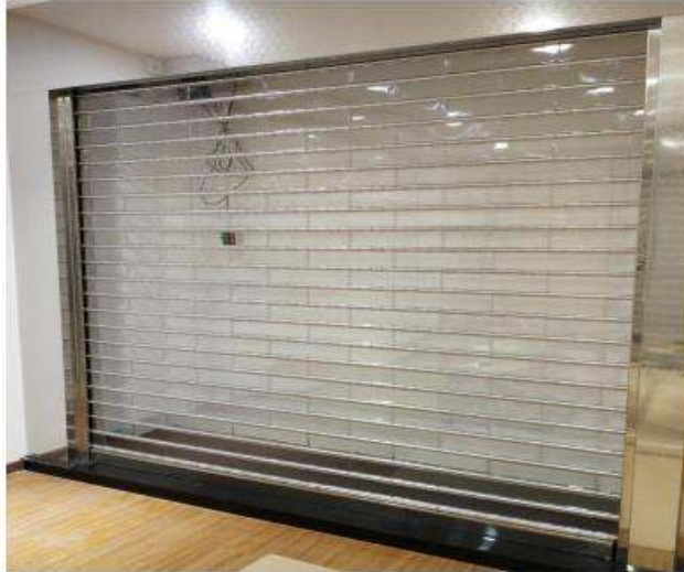
Finished product model