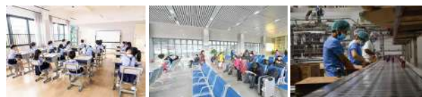
โรงเรียน สถานีส่งสนามบิน โรงงานอุตสาหกรรม