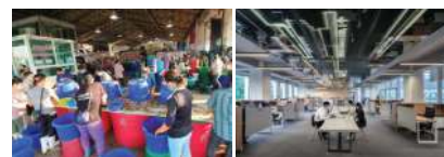
ตลาด/ห้องสรรพสินค้า ออฟฟิศ/สำนักงาน