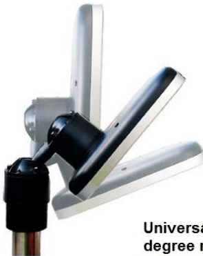
Universal joint ,360 degree rotation