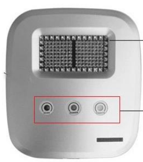
Infrared sensor lamp