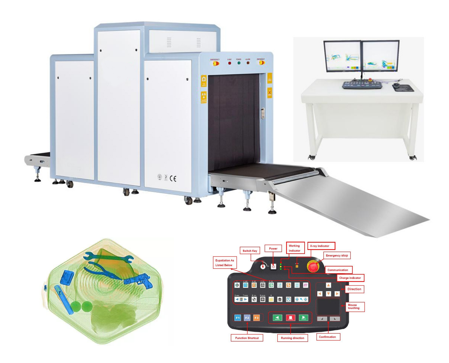
High resolution image