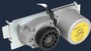
BRUSHLESS DC MOTOR 120W BRUSHLESS DC MOTOR