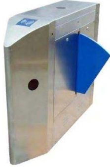
Single mechanism type